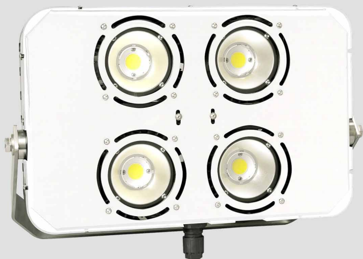
HIGH POWER LED FLOODLIGHT FOR DECKS, HOLDS AND SEAPORTS