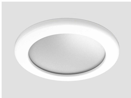
Ring A2, 5543000200-005 Steel / RAL9016 / Satin lens