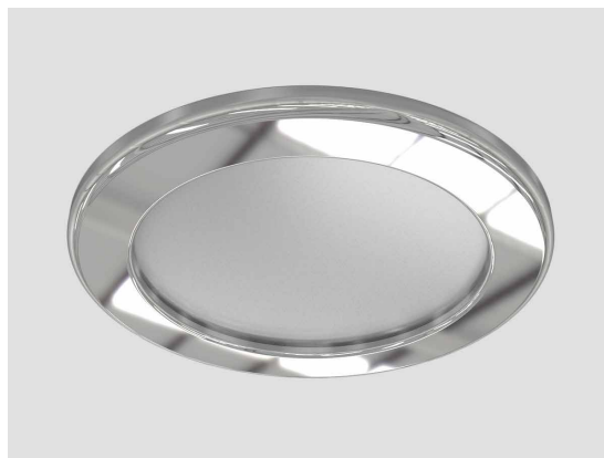
Ring A2, 5543000200-003 Chrome / Satin lens