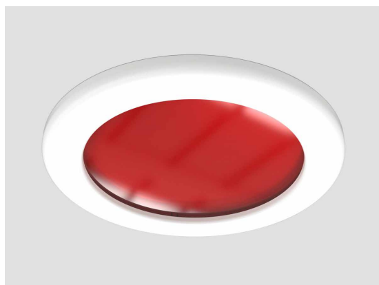
Ring A2, 5543000200-072 Steel / RAL9016 / Clear lens RED