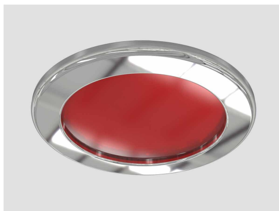
Ring A2, 5543000200-053 Chrome / Clear lens RED