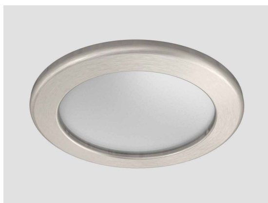
Ring A2, 5543000200-015 Steel brushed / Satin lens