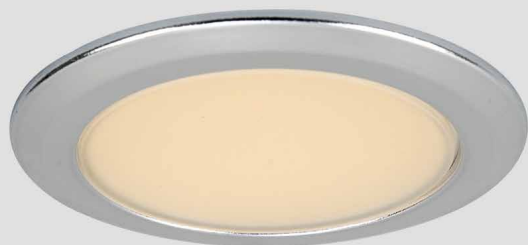
FLAT LED FURNITURE LIGHT