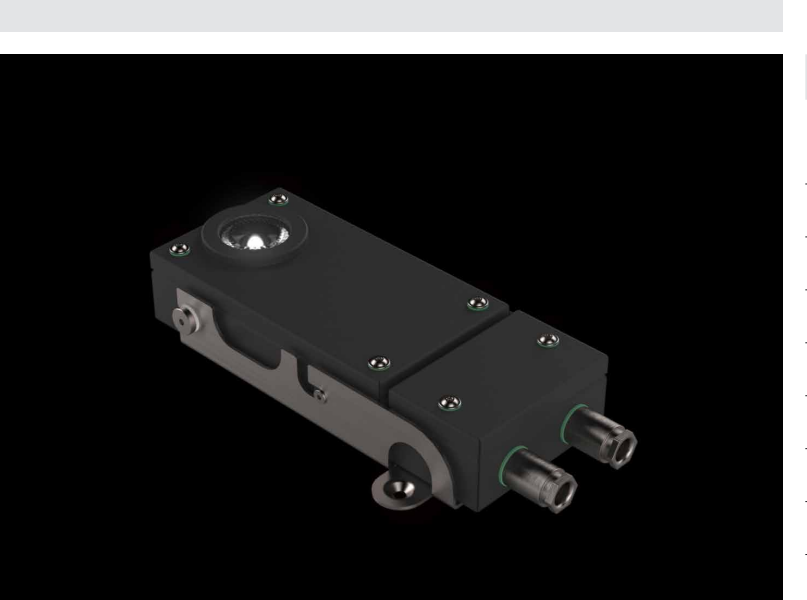
REMOVABLE BACKUP LIGHT WITH INTEGRATED BATTERY FOR THE SHIP'S EMERGENCY LIGHTING SYSTEM