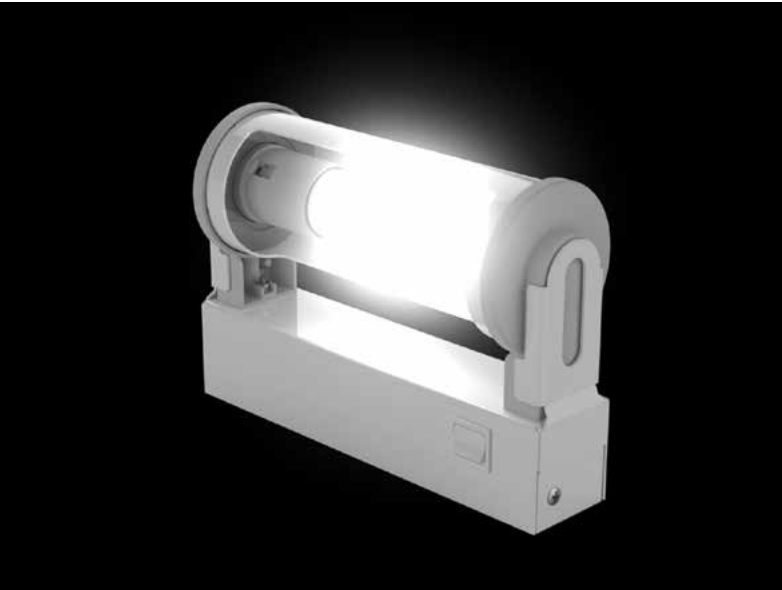
BERTH LIGHT WITH SWITCH AND SWIVELING REFLECTOR FOR CABINS AND ACCOMMODATION AREAS